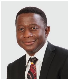
Professor Mike Sathekge

I am pleased to announce the signing of a Bilateral Agreement between The Colleges of Medicine of South Africa (CMSA) and The South African Committee of Medical Deans (SACOMD).