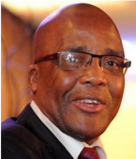
Dr Aaron Motsoaledi